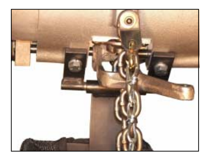
Figure 3. View Showing Hanger Bracket Bolted to Hoist Frame

Position container at bottom of hoist with hanger bracket holes aligned with tapped holes on sides of control shaft bosses (Figure 3)., Secure bracket with two 5/16-18x5/ 8"hex head bolts and lockwashers provided.