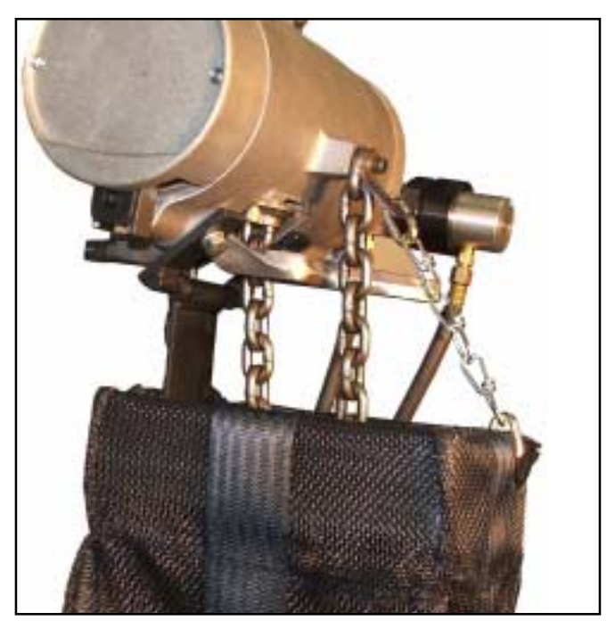
Figure 1. Catalog No. 902631 Chain Container Installed on Coil Chain Hoist

*Hanger Parts Kits contain: one support chain; two split links; chain hanger plate; one 1/4-20x2-1/4" Hex Hd. bolt, lockwasher and nut; and two 5/16-18x5/8" Hex Hd. bolts and lockwashers.